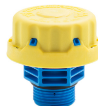
P766646 Glass-filled nylon 1" BSP Total Height: 72.1 Diameter: 80.8 Efficiency: 10µm @ 98%