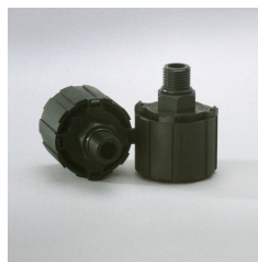
P566174 Glass-filled nylon 9/16" - 18UNF Total Height: 55.4 Diameter: 41.9 Efficiency: 3µm @ 98%