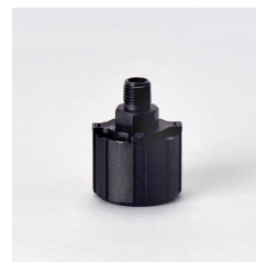
P567392 Glass-filled nylon 1/4" NPT Total Height: 55.4 Diameter: 41.9 Efficiency: 3µm @ 98%