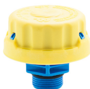
P766645 Glass-filled nylon 3/4" BSP Total Height: 64 Diameter: 72.5 Efficiency: 10µm @ 98%