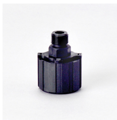
P567390 Glass-filled nylon 3/8" NPT Total Height: 55.4 Diameter: 41.9 Efficiency: 3µm @ 98%