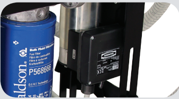
High quality 12 Volt Vane pump