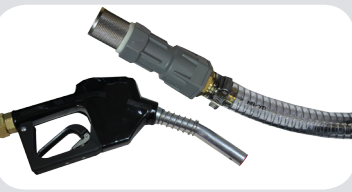
Hoses and fittings supplied

The Donaldson Bu.F.S.S.12V provides off line filtration and fuel transfer capability in a compact package. Designed as a portable unit requiring a simple 12 Volt power supply, it is ideal for mobile applications such as in-field vehicle refuelling or fuel transfer from mobile tanks.