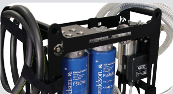
Powder coated heavy gauge steel frame