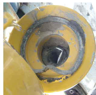
With P618619 Gasket